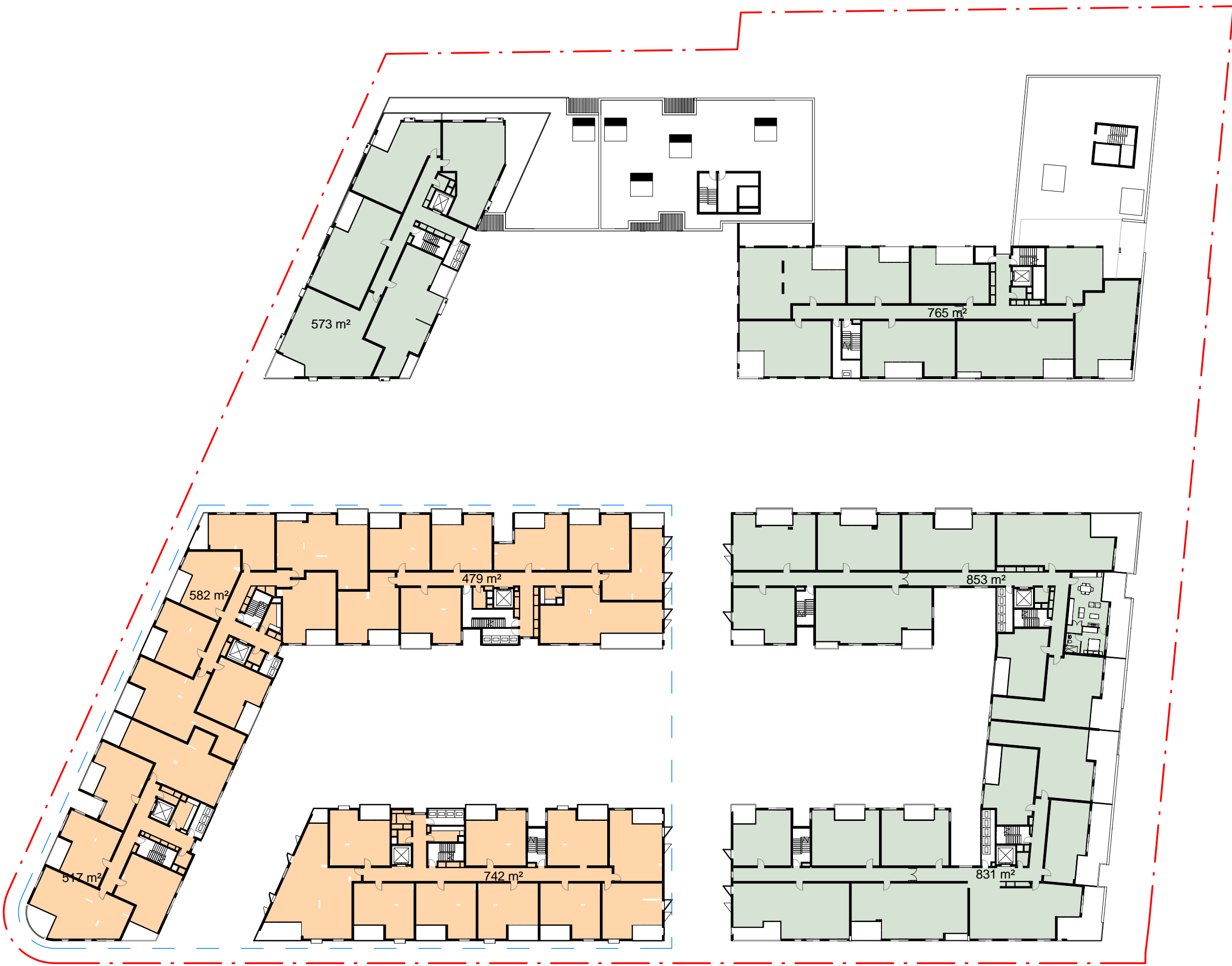
1 LVL 04 - GFA PLAN SCALE 1 : 500