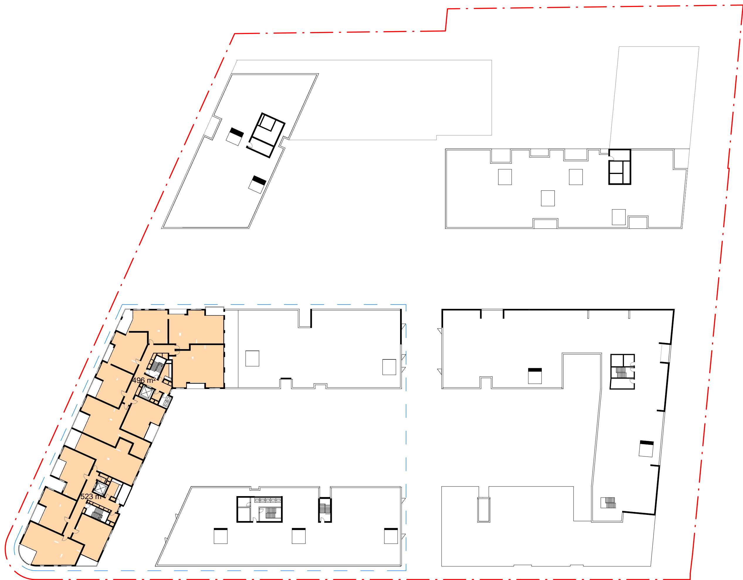
4 LVL 07 - GFA PLAN SCALE 1 : 500