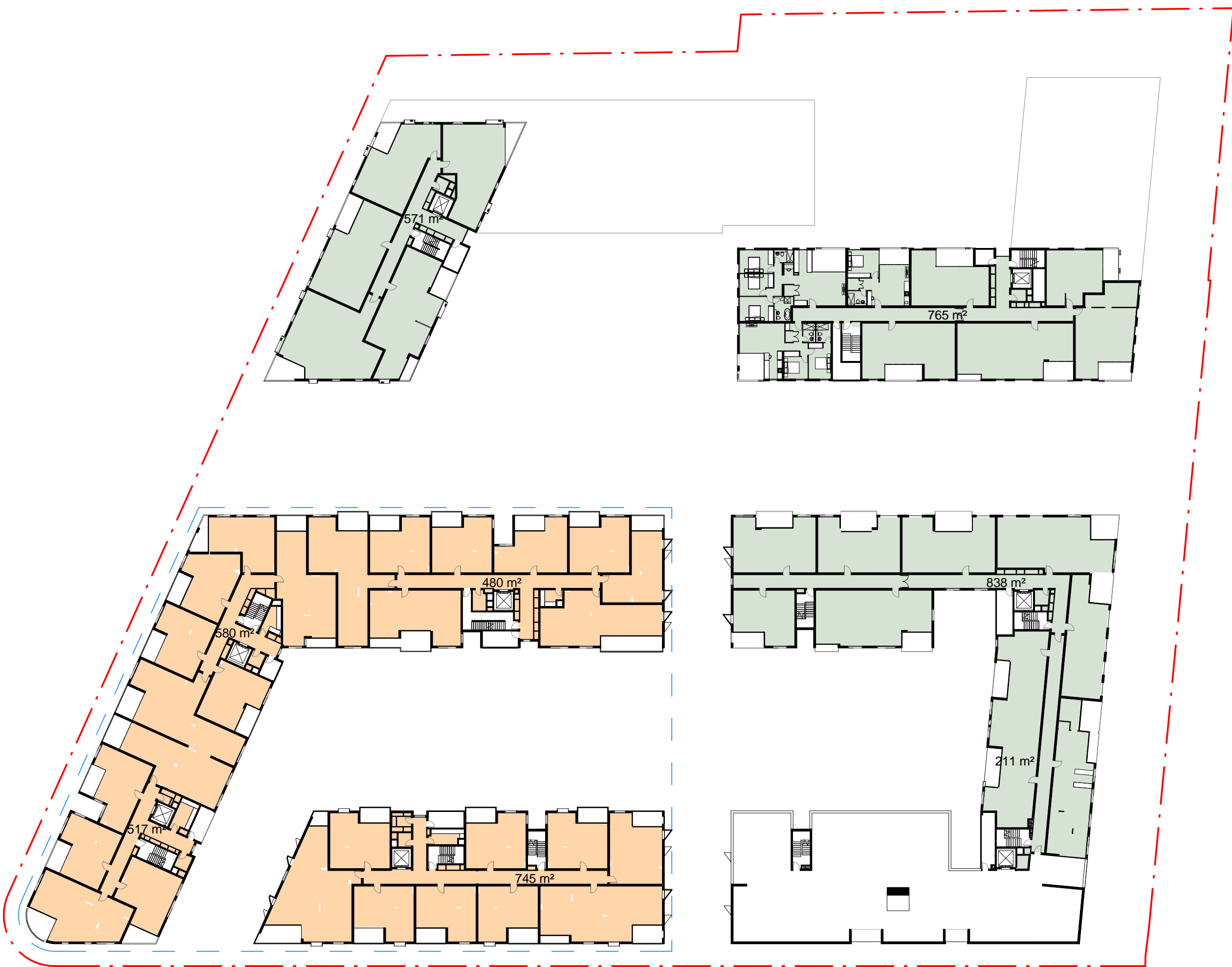
3 LVL 06 - GFA PLAN SCALE 1 : 500