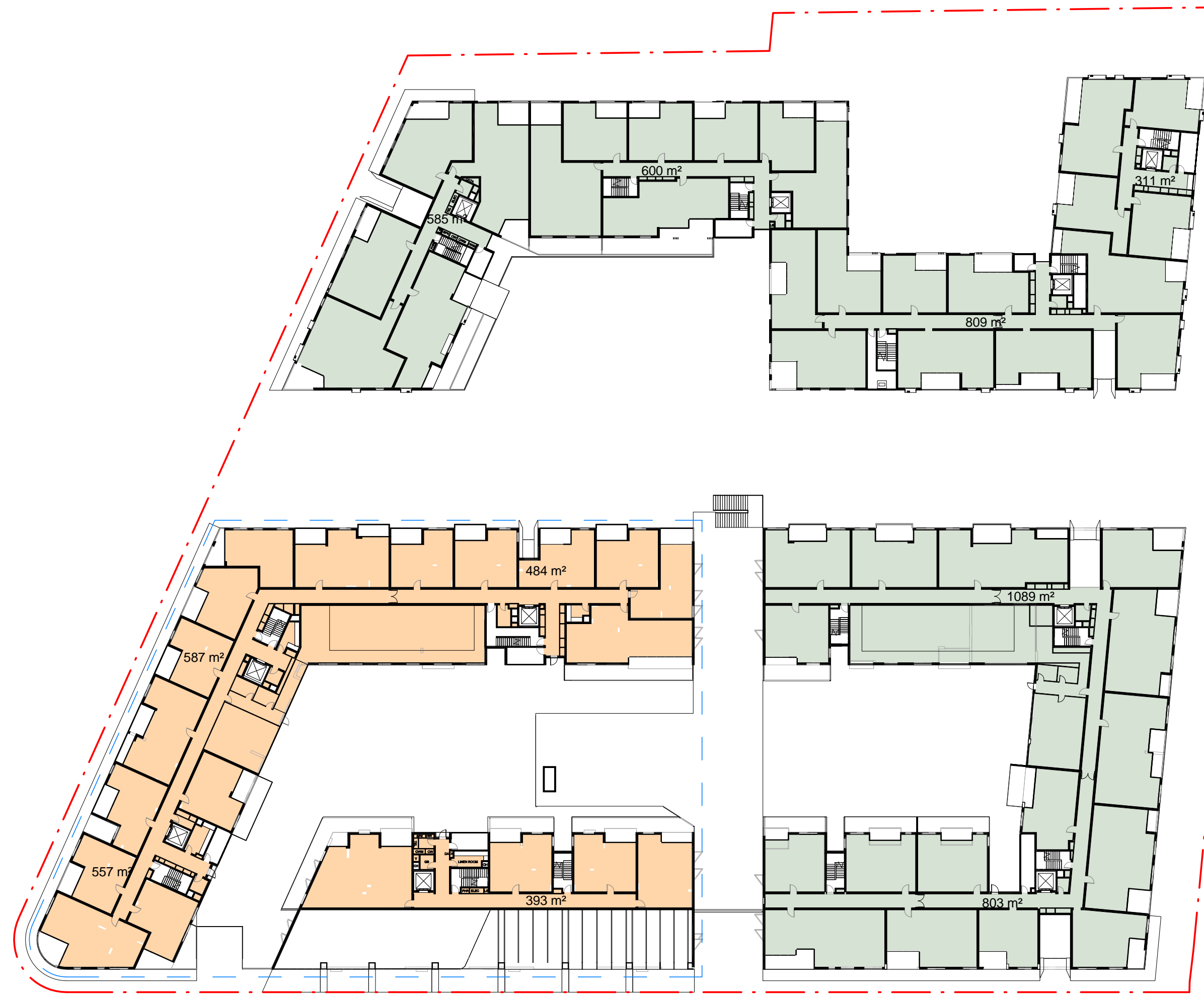
2 LVL 01 - GFA PLAN SCALE 1 : 500