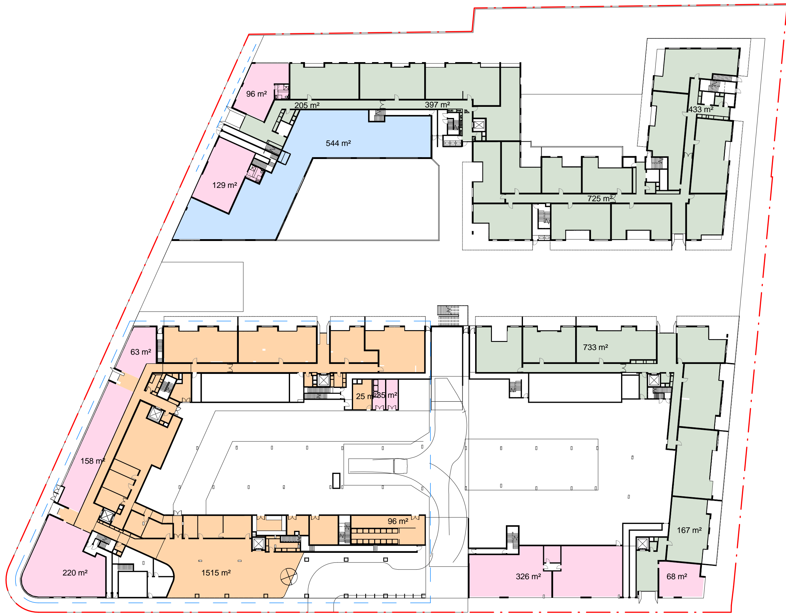
1 GROUND - GFA PLAN SCALE 1 : 500