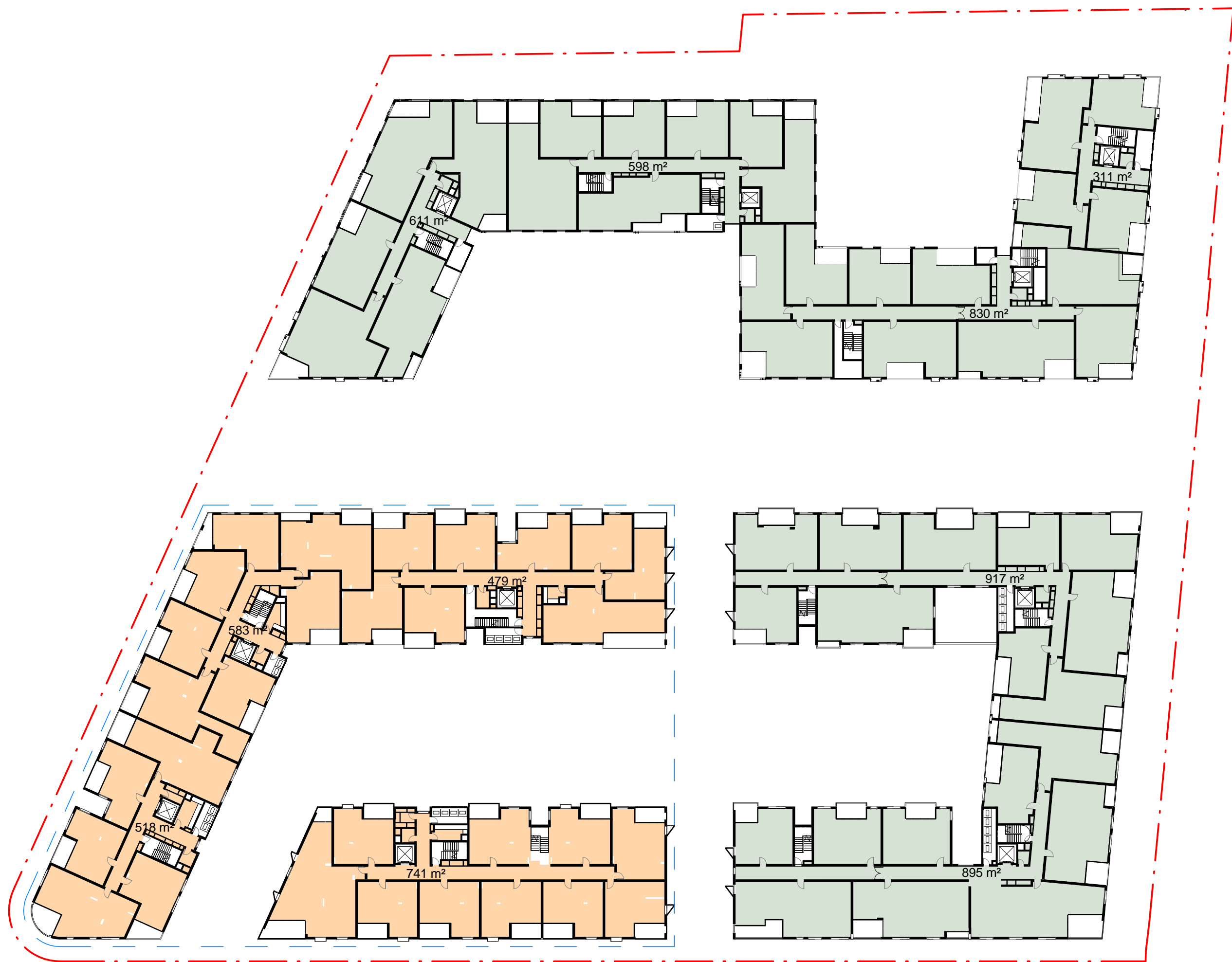
3 LVL 02 - GFA PLAN SCALE 1 : 500